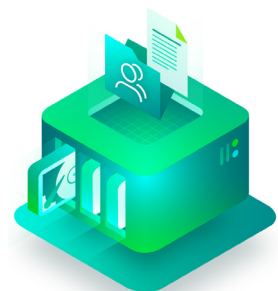
Individual files and folders

Veeam® is the leader in backup solutions that deliver Cloud Data Management™. Veeam provides a single platform for modernizing backup, accelerating hybrid cloud and securing your data. Our solutions are simple to install and run, flexible enough to fit into any environment and always reliable .