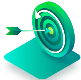
Rollback to a point in time

Quick rollback gives you the ability to roll back to the last-known good configuration or backup. This means that any modified file since the last backup can be reverted. The example here would be a ransomware attack and the encryption of a file share. This option would allow you roll back to the last good backup before the ransomware attack occurred.